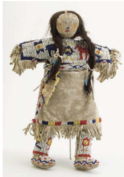
ABOVE: A plains doll (12½" x 9" x 3"), from the early 1900s made of buckskin, cotton material, sinew, hair, and glass beads, on display as part of More than Child's Play: American Indian Dolls , August 14–January 2, 2011, at the Heard Museum North in Scottsdale, Arizona.

LOS ANGELES | Weavers' Stories from Island Southeast Asia . August 1–December 12. Nini Tawok's Spinning Wheel . August 1–December 5. Fowler Museum, UCLA North Campus. (310) 825-4361; www.fowler.ucla.edu .