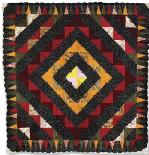
ABOVE: In Stitches: Quilts from the Allentown Art Museum Collection is on view through September 5 at the Allentown Art Museum, Allentown, Pennsylvania. Shown here is Elizabeth Fowler's Log Cabin (Barn Raising) silk pieced quilt top, circa 1900.

MILWAUKEE | 2010 Fine Furnishings and Fine Craft Show . October 2–3. Harley-Davidson Museum site, The Garage, 400 Canal St. (401) 816-0963; www.finefurnishingsshow.com .