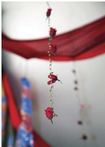
ABOVE: Xewa Cantons (with detail) , a site-specific installation by Consuelo Jimenez Underwood, is on display through July 29 at the Gualala Arts Center in Gualala, California.

DENVER | Shape & Spirit: Selections from the Lutz Bamboo Collection . Through September 19. Denver Art Museum, 100 W. 14th Ave. Pkwy. (720) 865-5000; www.denverartmuseum.org .